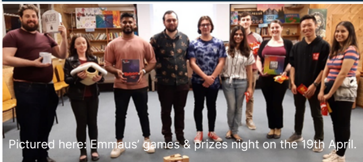
Pictured here: Emmaus' games & prizes night on the 19th April.