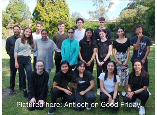
Pictured here: Antioch on Good Friday